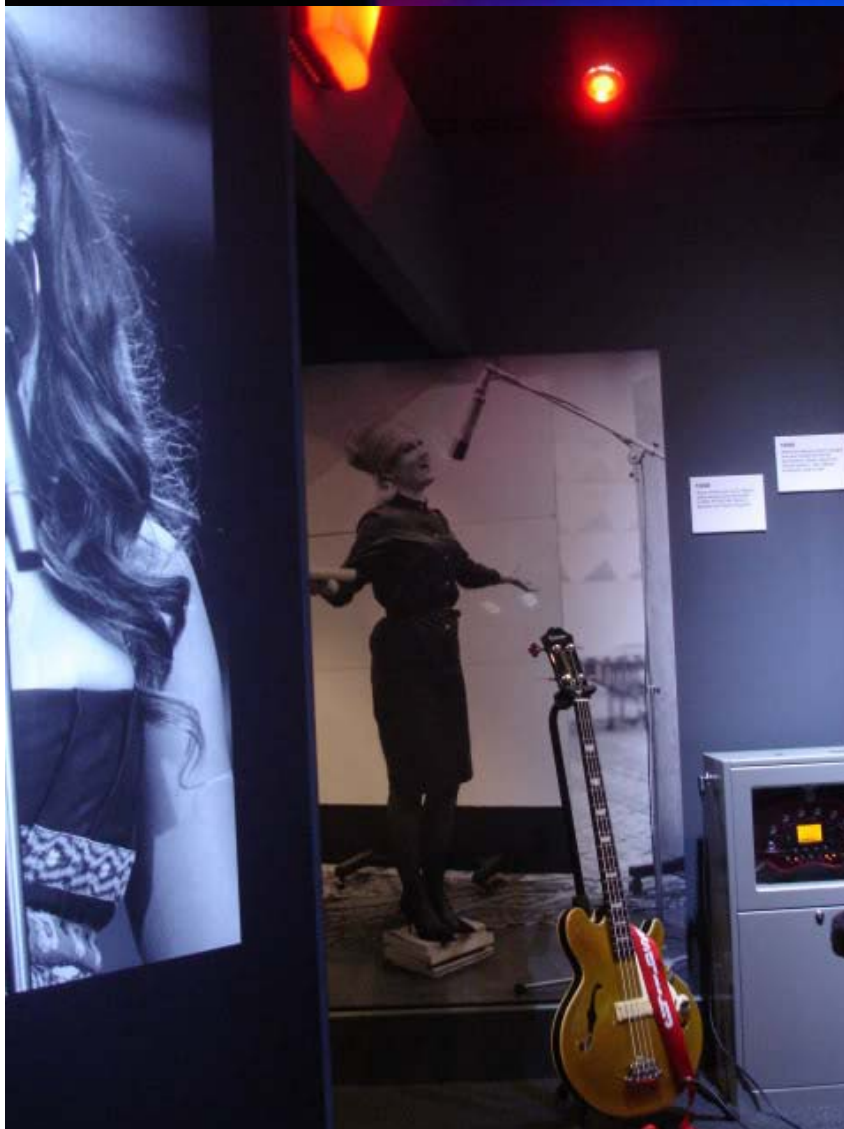
Kate Bush's red shoes (the only mention of Kate):