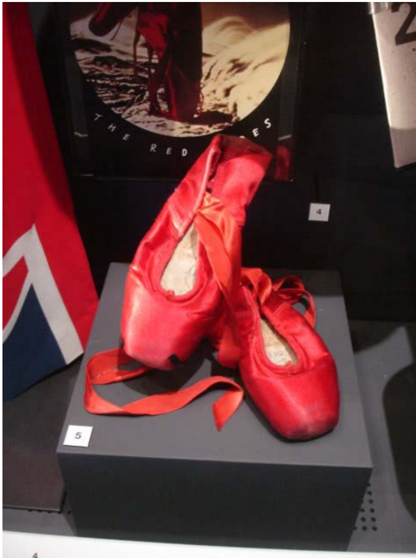
Totally iconic outfits donated by David Bowie. This was a WoW moment for me but, again, not much information on Bowie as an artist: