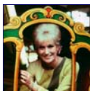
United Kingdom 5309 Posts