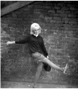
Not sure where or when, probably 1968