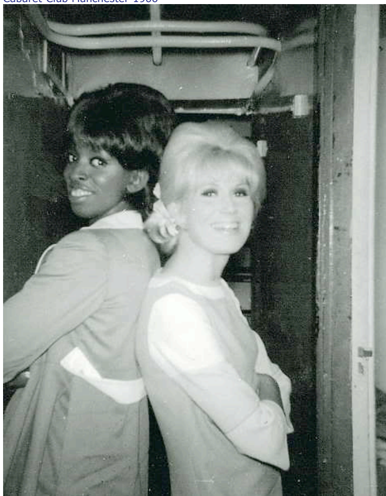
Brooklyn Fox 1964