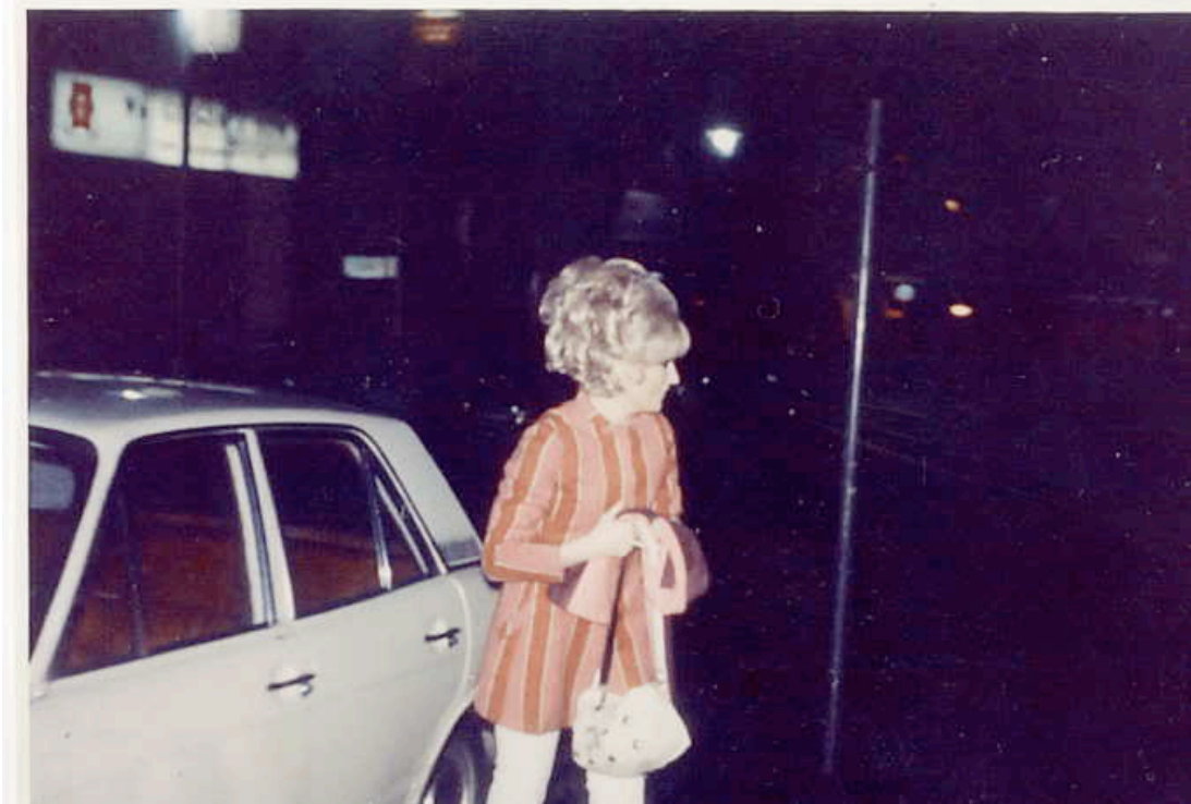
Golders Green or Shepherds Bush?