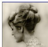
Cabaret Club Manchester 1966