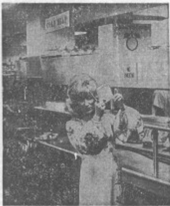
BLUE ROOM STAR DUSTY SPRINGFIELD Primping in the kitchen before going on.

Dusty seems to be ignoring the frantic sign language. There's just so much to talk about—her passion for jazz and June Haver music, the times she was deported from South Africa, her brother's hangup with Carmen Miranda.