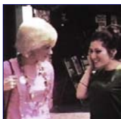
USA 5821 Posts