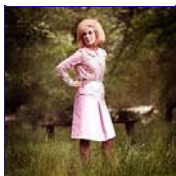
United Kingdom 7603 Posts

Oh yes I realise that and there is absolutely no doubting your affection and admiration for Dusty :) I only wish you'd joined us here on LTD ages ago!! :)