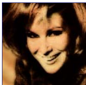
USA 634 Posts