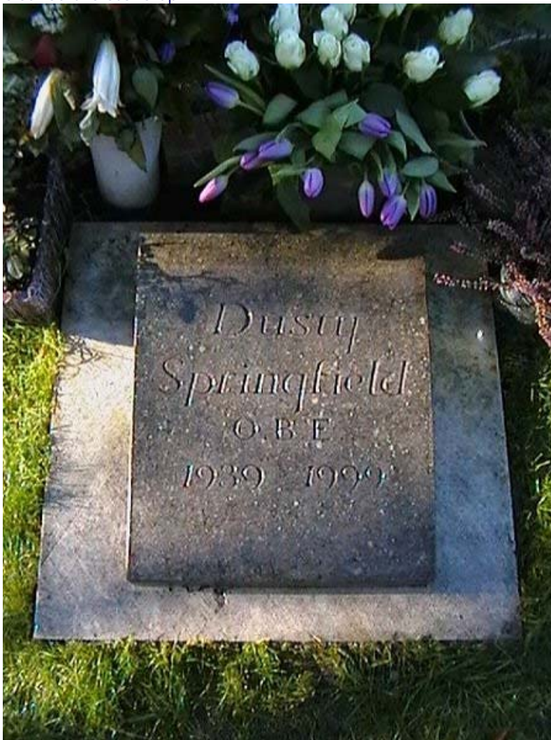
The finished article :