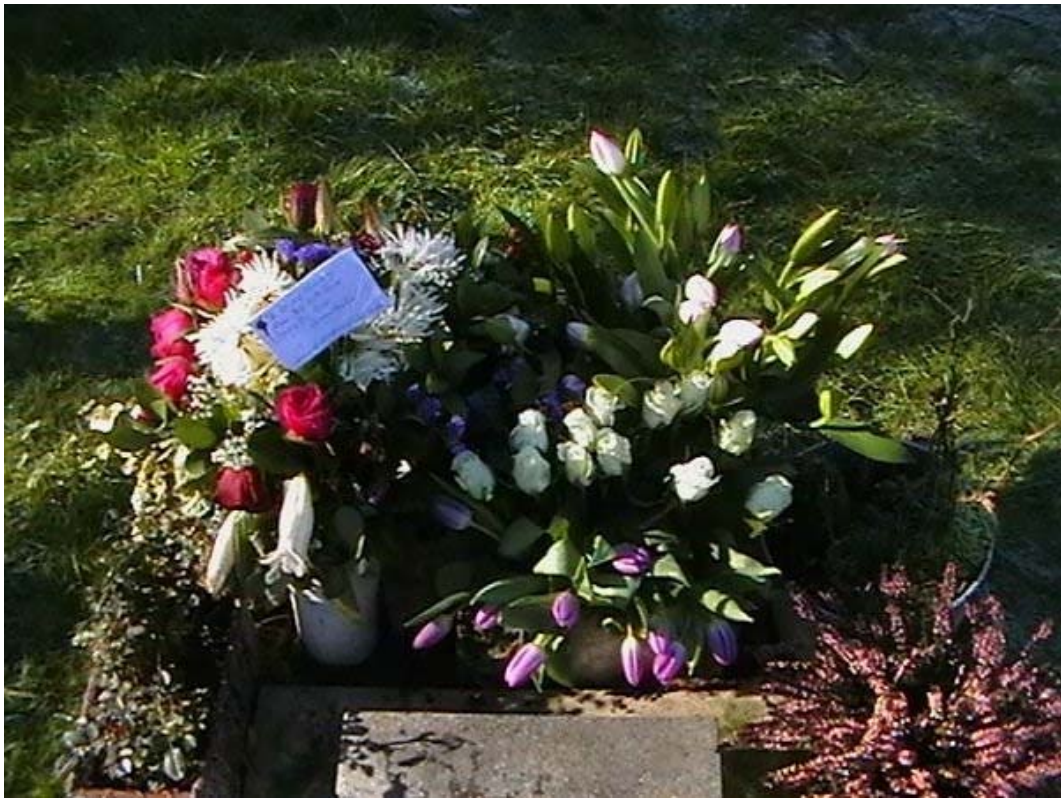
Cleaned the stone up :