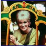
United Kingdom 5309 Posts