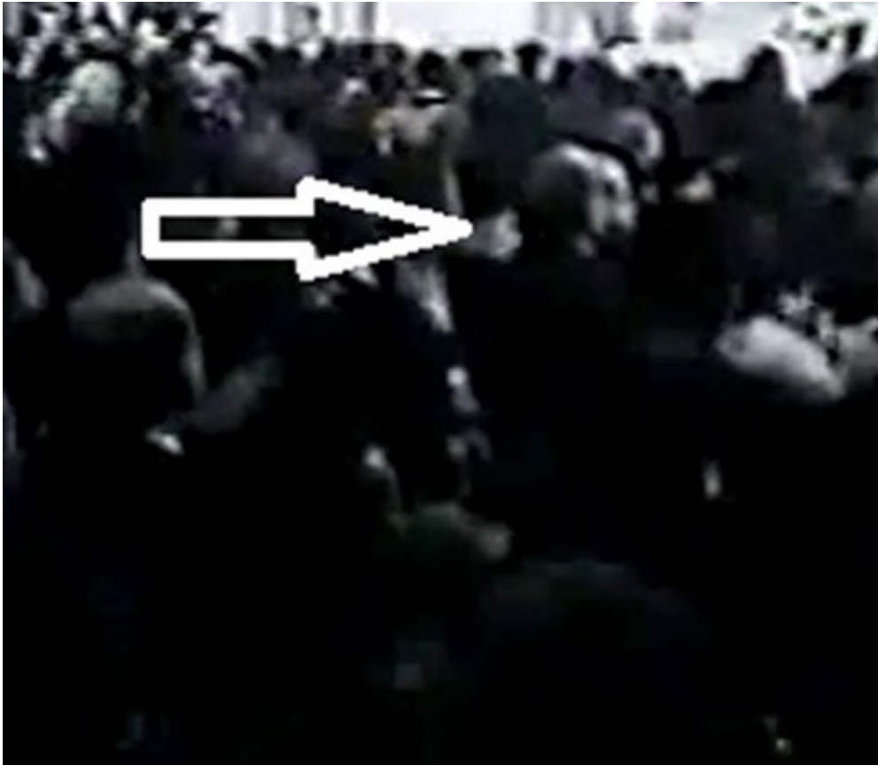
1965 - San Remo YDHTSYLM.jpg (33.94 KiB) Viewed 4182 times