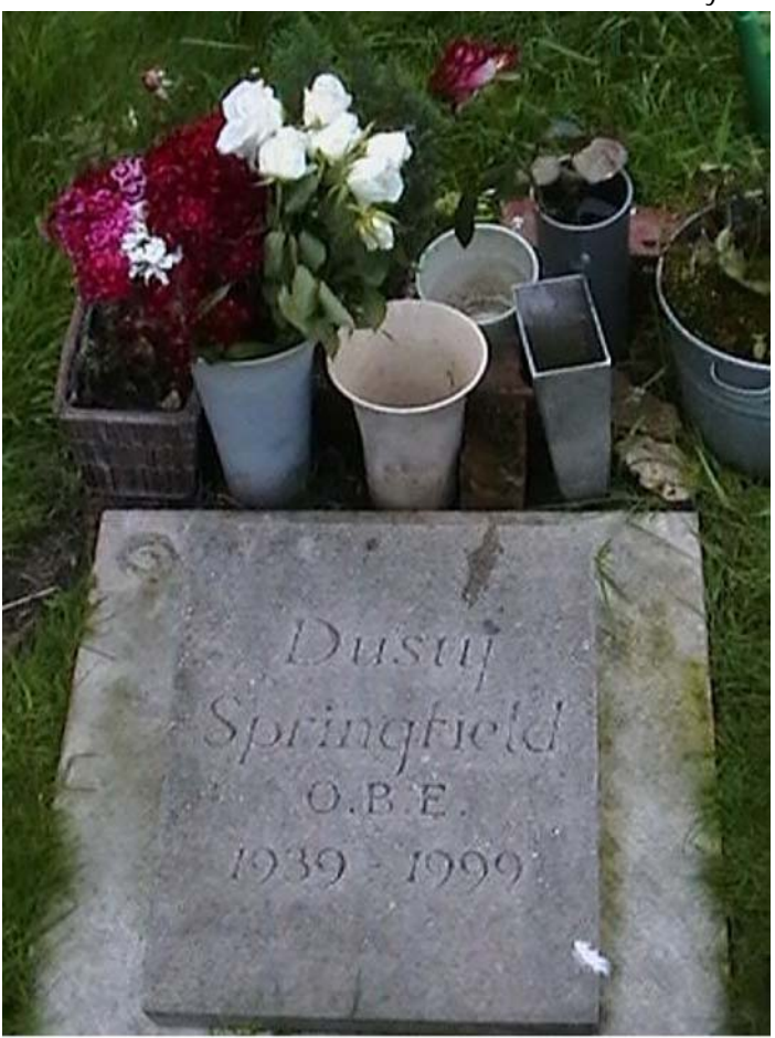
LTD flowers looking a little worse for wear