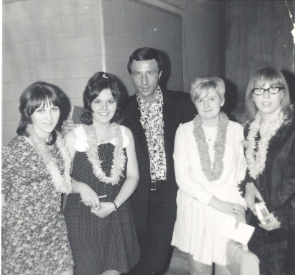
Castaways Peppi.jpg (54.37 KiB) Viewed 5794 times

We were lucky and the photos help with the memory all these years on.