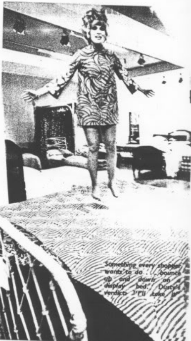
Something every shopper wants to do . . . bounce up and down on display bed. Dusty's verdict: "I'll take it."