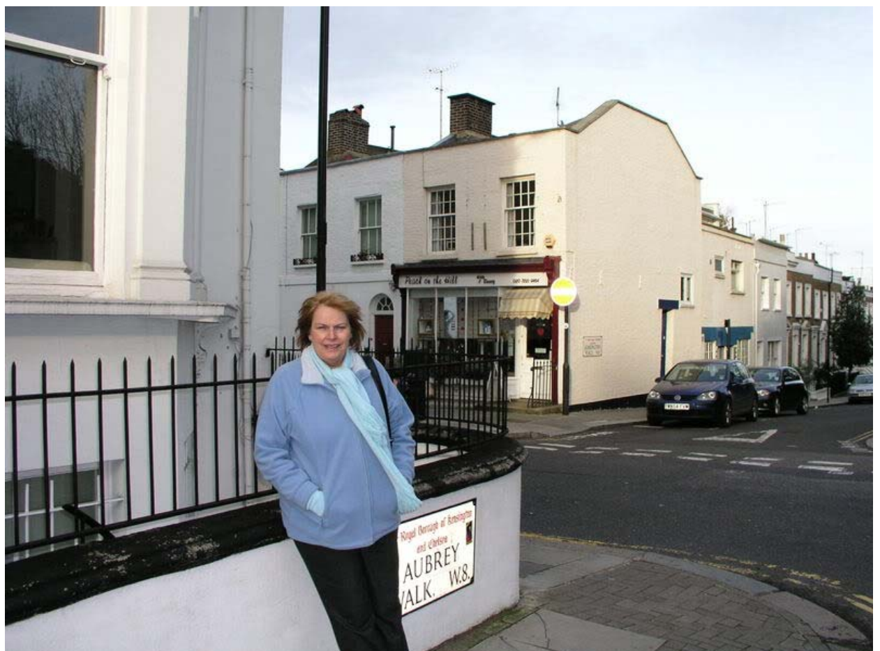
More survivors from the Victorian era!.....it really is an Oasis of calm in Aubrey Walk, considering all the hustle and bustle of Notting Hill Gate and the Portobello Market just down the Hill!