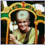
United Kingdom 5309 Posts