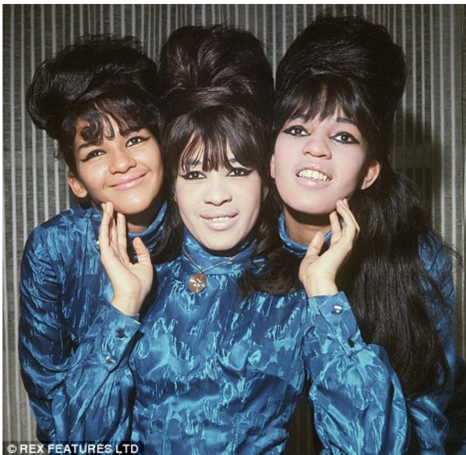
ronettes 1.jpg (90.47 KiB) Viewed 1121 times