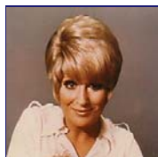
Australia 97 Posts