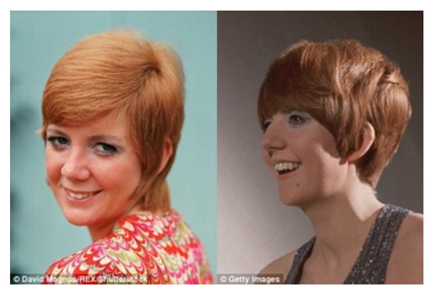
Cilla Black 2.jpg (82.93 KiB) Viewed 3608 times