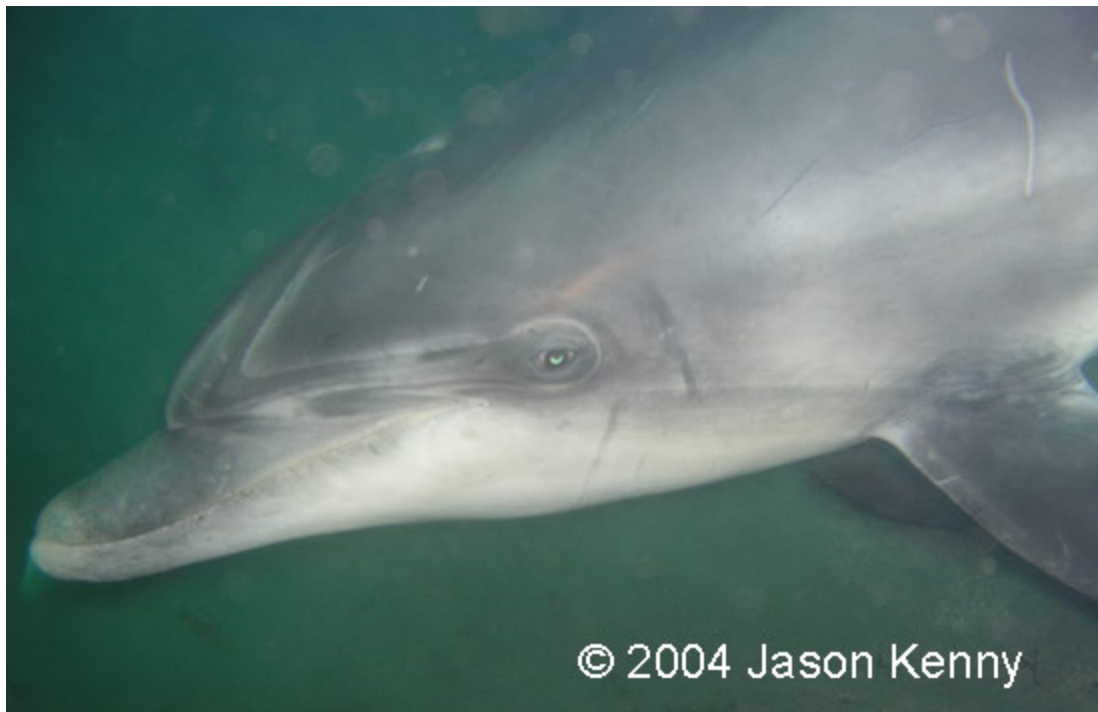
dusty2004_jc1009_04 Dolphin.jpg (21.5 KiB) Viewed 1192 times