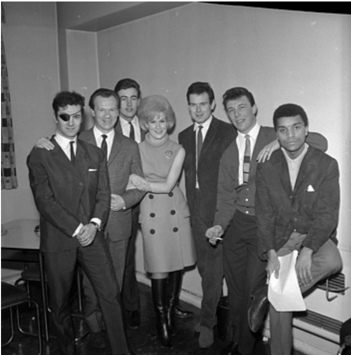
2006BA2968_jpg_ds.jpg (33.9 KiB) Viewed 1497 times