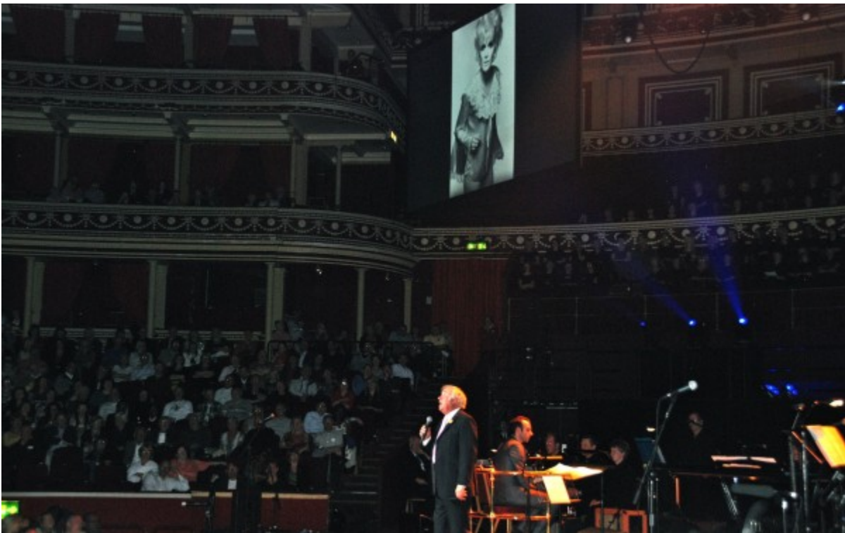
Then on came one of the few performers that I was familiar with, Boy George taking on the difficult task of 'YDHTSYLM' Not an easy task...especially if your not up for it. Maybe once upon a time he could have come close but... Rating: B-/C+