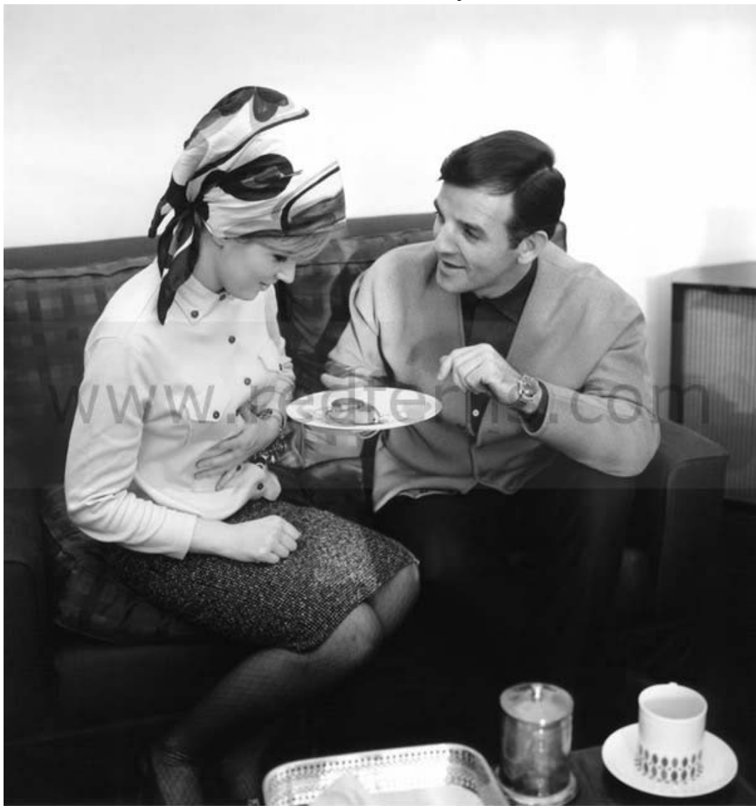
DR1001 Alan FREEMAN Alan FREEMAN