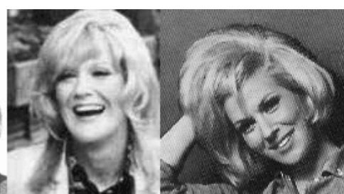
The Archives of Let's Talk Dusty!

Home | Profile | Active Topics | Active Polls | Members | Search | FAQ