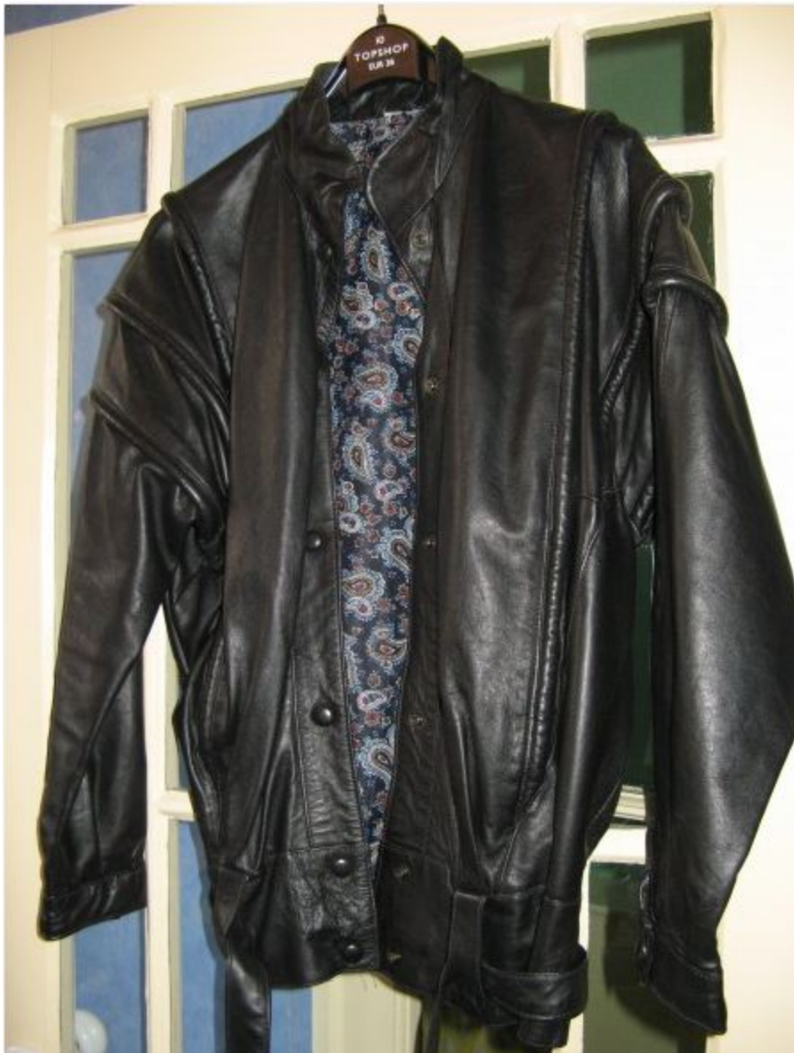
dusty jacket 2.JPG (54.54 KiB) Viewed 1433 times