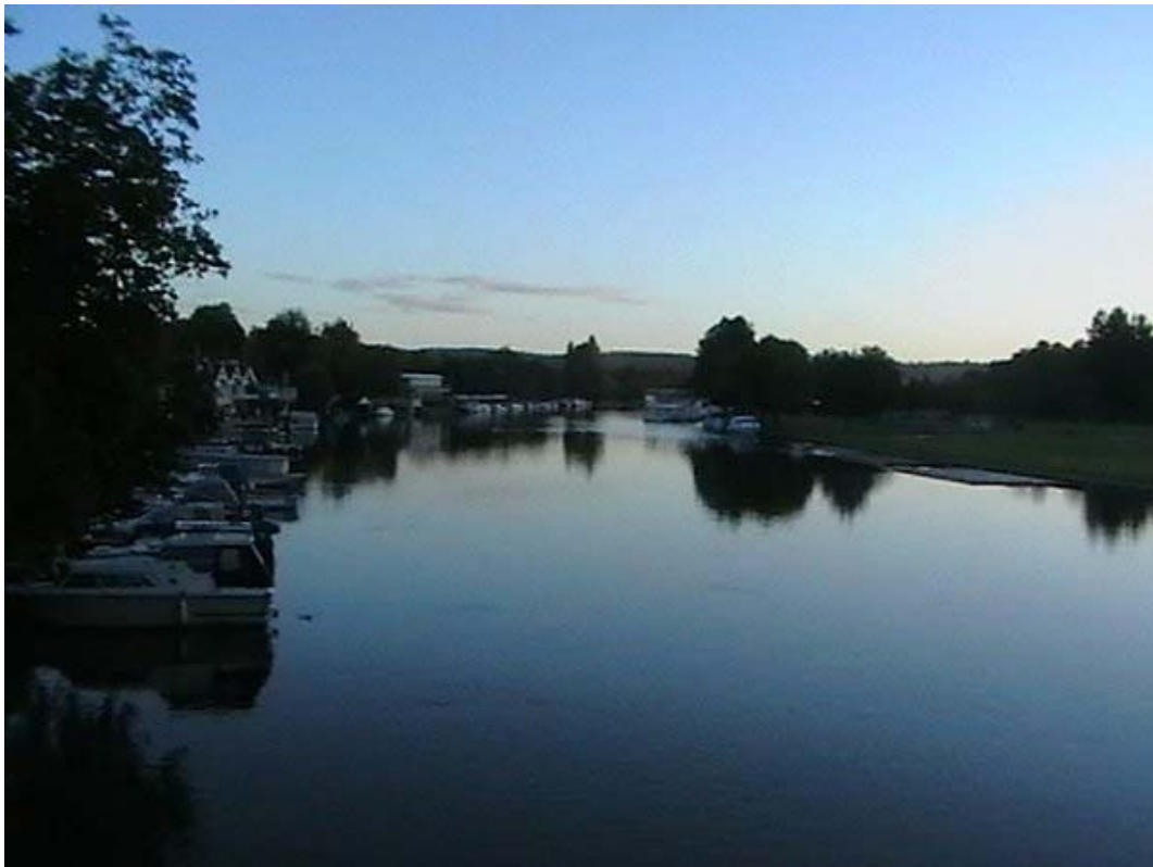
St Mary's 6.15am!