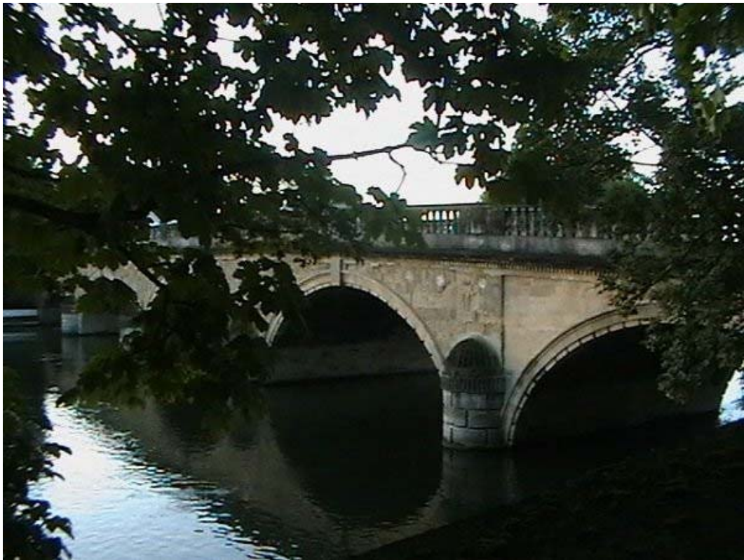
Dawn Over Dust!