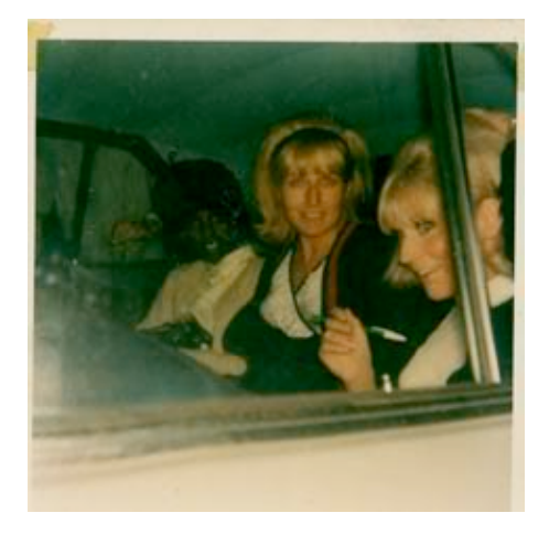
And in the dressing room afterwards