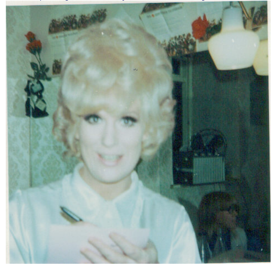
Sorry no dates etc for this one.