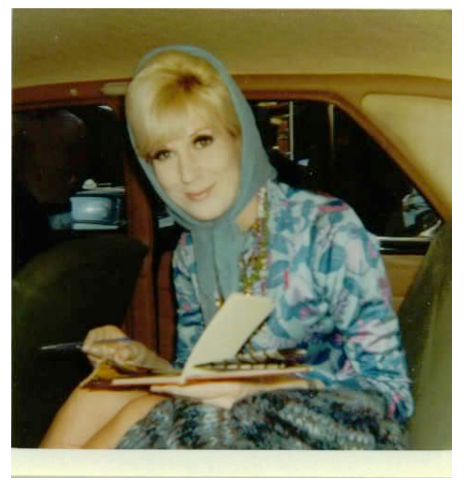
And another doing the same in Liverpool