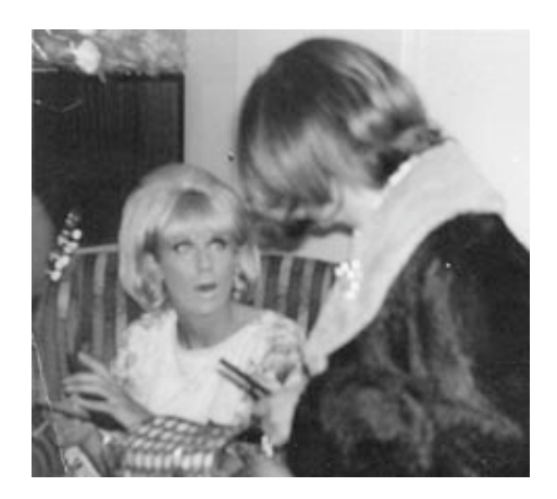
One protecting the "do", but not sure where