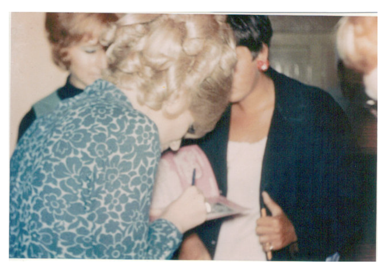
ABC Blackpool Aug 1968. You can just see me in the background! One of the rare ones with me on!