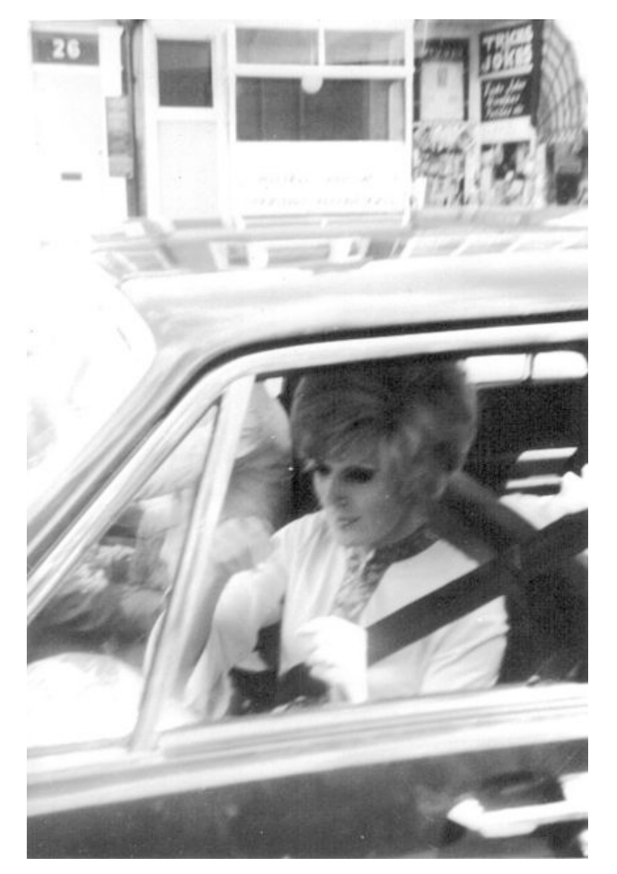
Talk London July 1968.