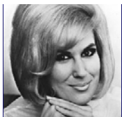
United Kingdom 428 Posts