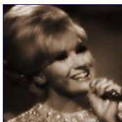
United Kingdom 1100 Posts