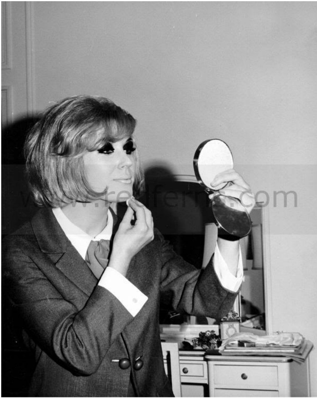
And LTD's latest controversial photo... 🤔