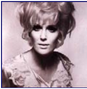
Australia 3323 Posts