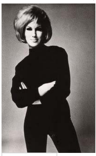
This image or video has been moved or deleted photobucket

This image or video has been moved or deleted