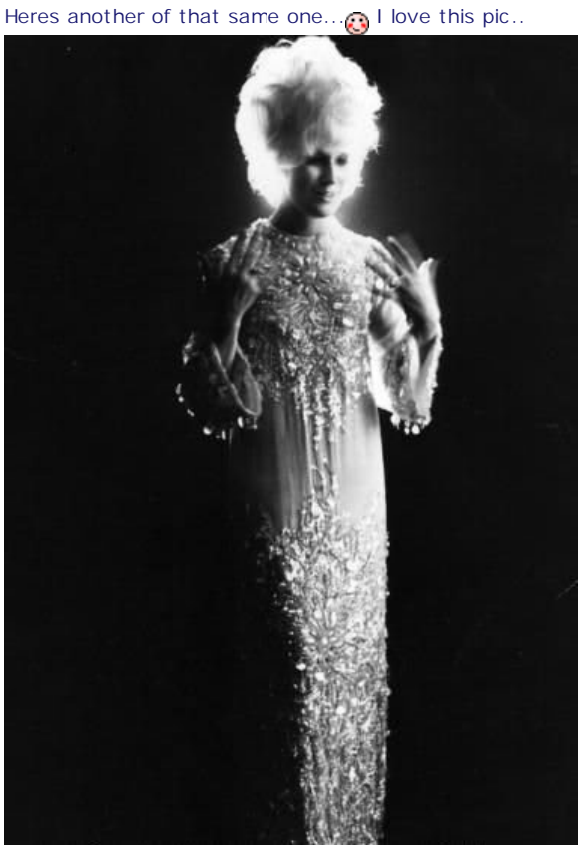
Heres my other three that \operatorname{id}\operatorname{pic}... these are the ones that \operatorname{left} an ever lasting impression with me.