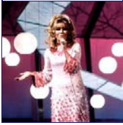
United Kingdom 3367 Posts

Oh I love it, its all fabulous dramatic wig shaking glorious wonderful Dusty, I dont even care about the song, she can wave those delightful arms around all day as far as im concerned