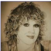
United Kingdom 119 Posts

I love this song and yes it is technically challenging..I think the only time Dusty messed it up s bit was on Ivor Novello awards when she came in too early on one verse.