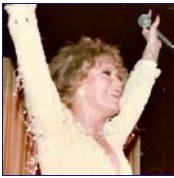
USA 3185 Posts

I believe this song is quite typical of Burt Bacharach's style; all his songs were difficult to sing.