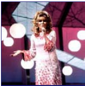
United Kingdom 3367 Posts

sorry rosie, i missed your post, i do care about the song but this one just fulfills the visual dusty thing with me, its bloody goooooorgeous!!!