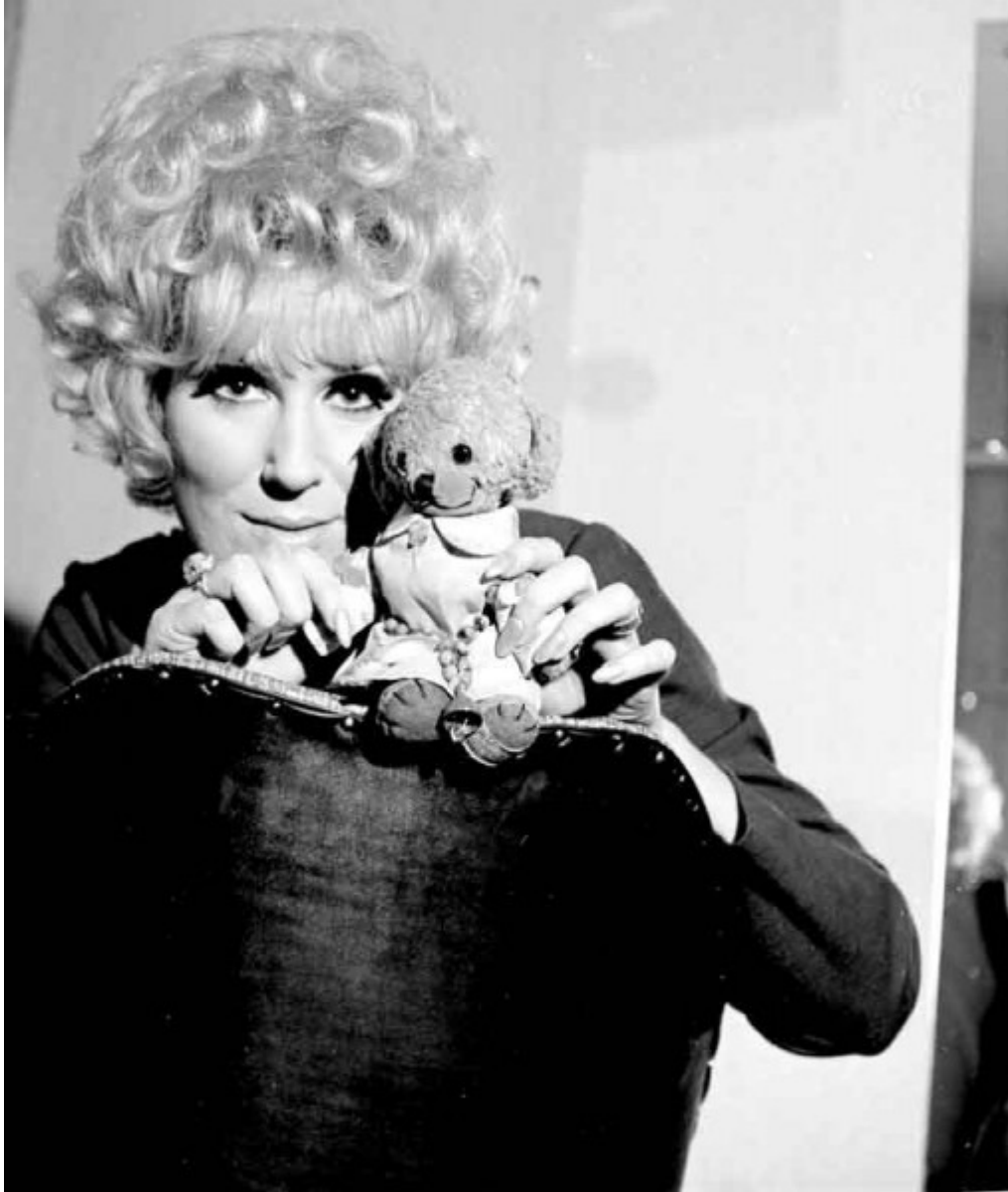
1968 - Batley Variety Club Einstein.jpg (54.16 KiB) Viewed 2965 times