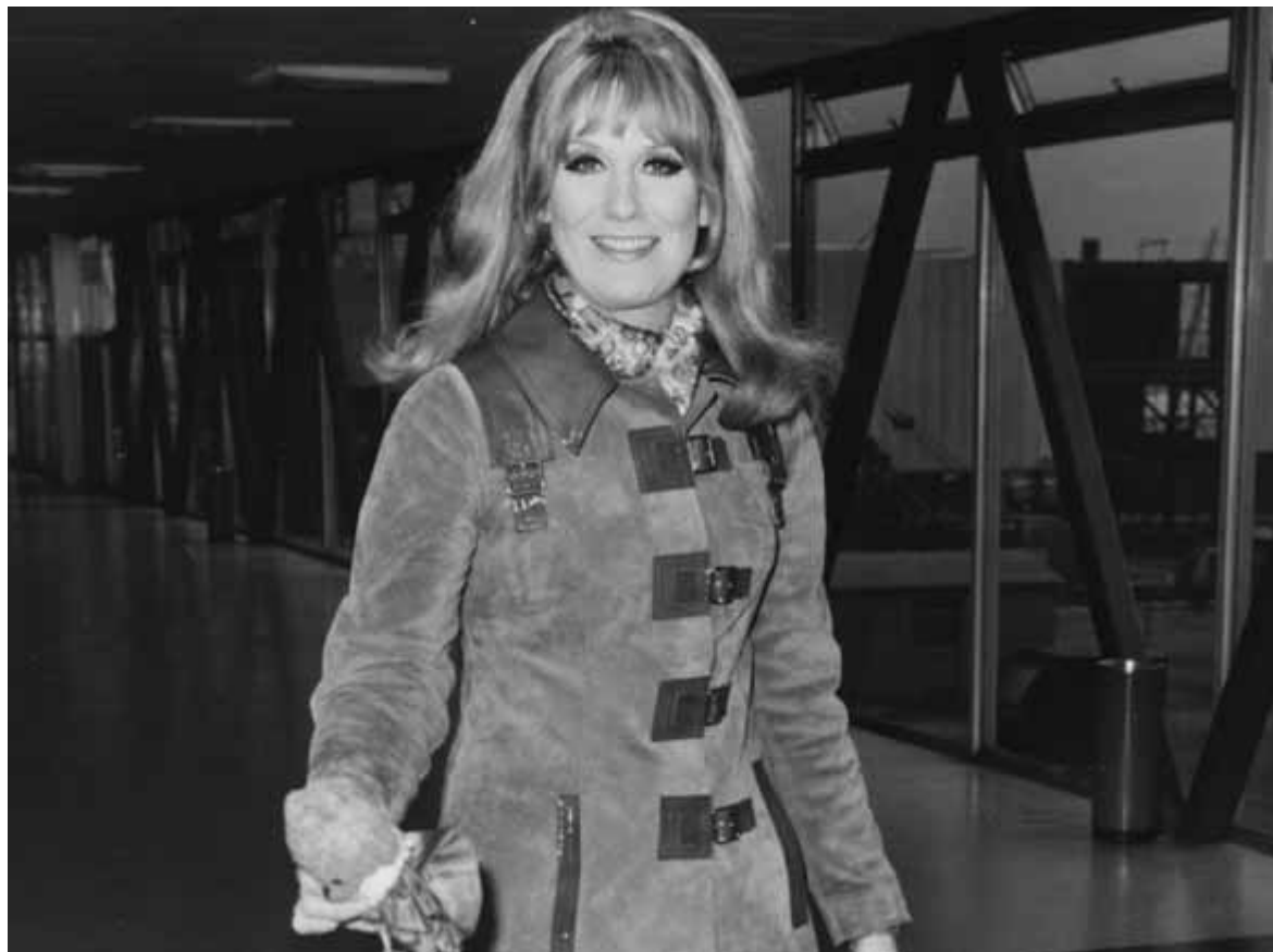
Airport Heathrow.jpg (17.56 KiB) Viewed 2874 times