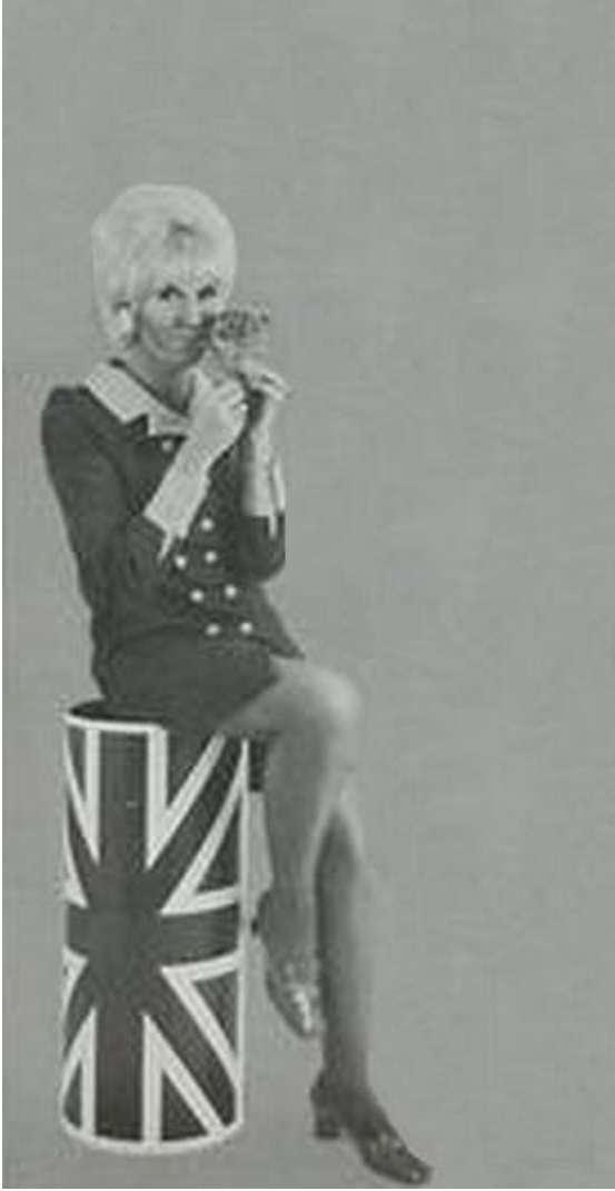
1964 - Einstein.jpg (12.43 KiB) Viewed 2930 times