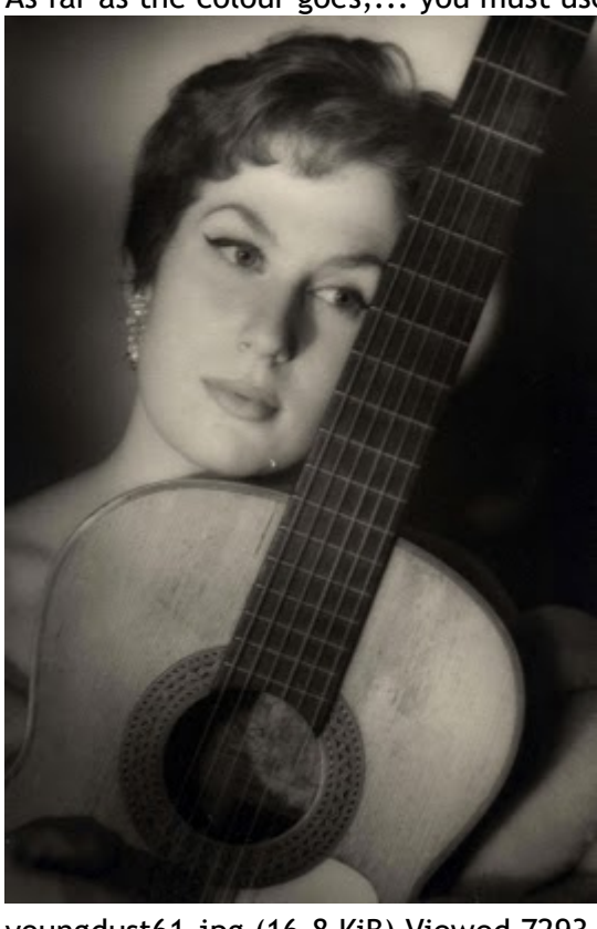
youngdust61.jpg (16.8 KiB) Viewed 7293 times

As far as the colour goes,... you must use your imagination.