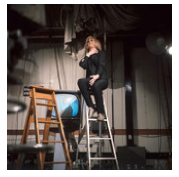
1963 - RSG.jpg (12.2 KiB) Viewed 6195 times

The shirt is definately black. If you zoom in on the small one you'll see she's in all black.