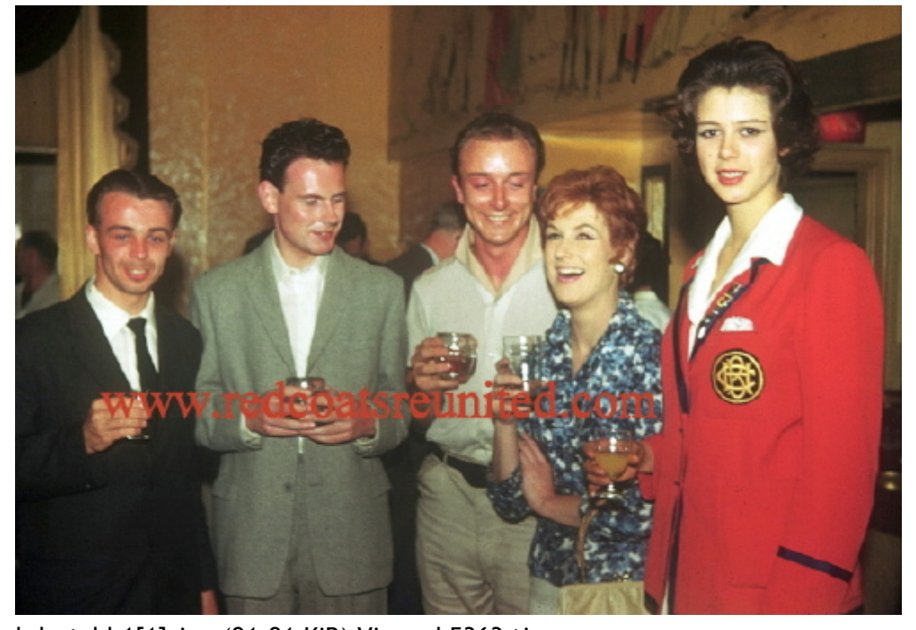
bdustybb1[1].jpg (91.91 KiB) Viewed 5363 times