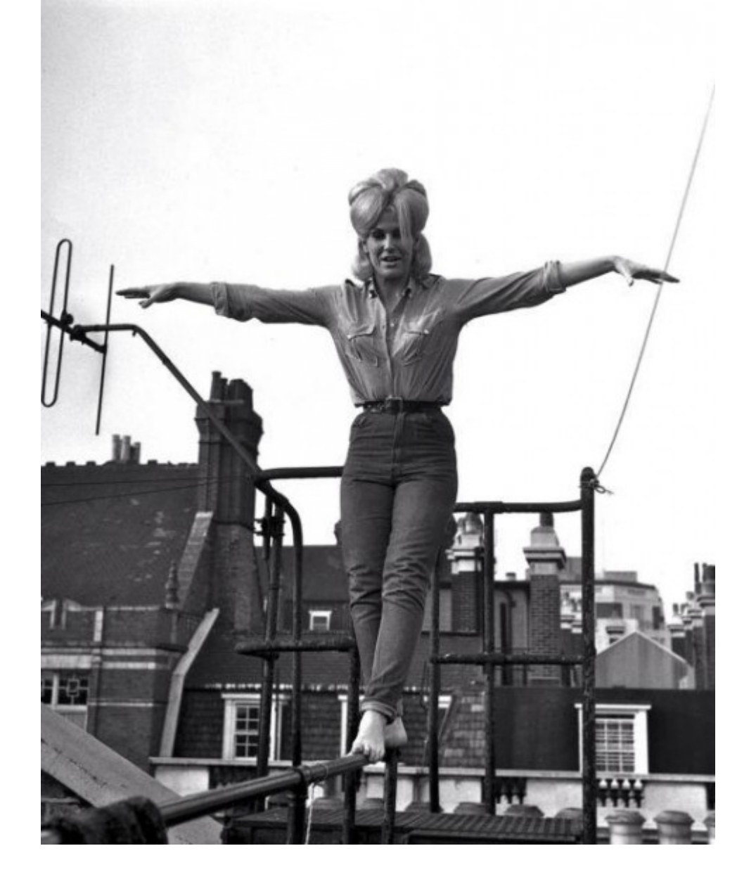
Here's what some of the surrounding buildings look like: