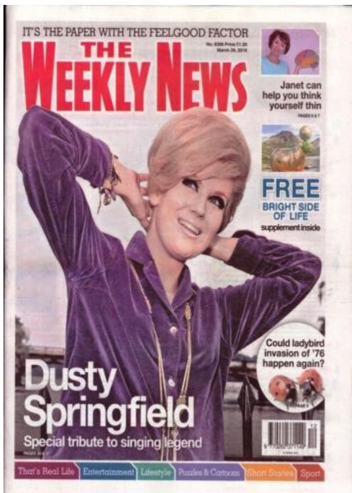
$_12.JPG (38.42 KiB) Viewed 4342 times