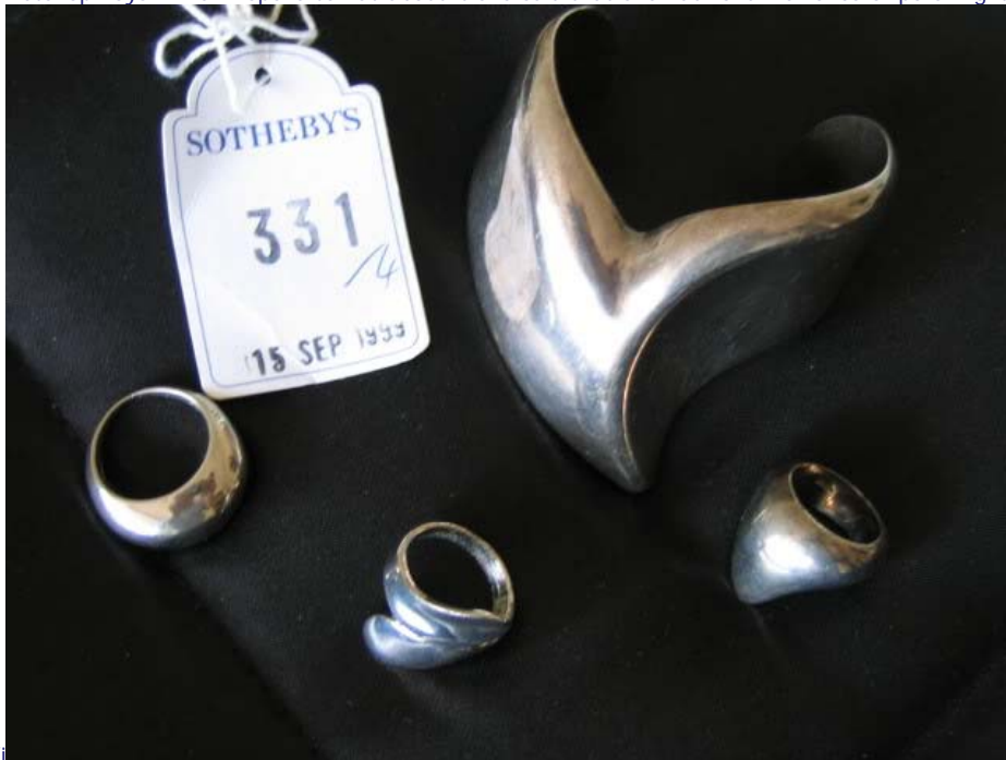
Dusty. [ /img]