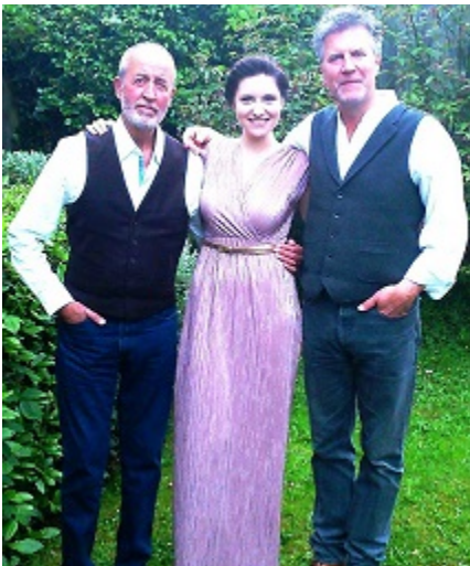
MikeHurst&TheSpringfields.jpg (48.7 KiB) Viewed 1343 times

by Sweetbaby » Tue Feb 20, 2018 12:13 am