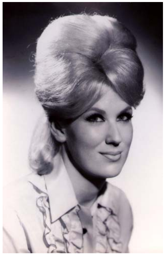
Oh, so NOW it works!