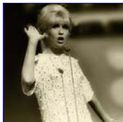
USA 5012 Posts