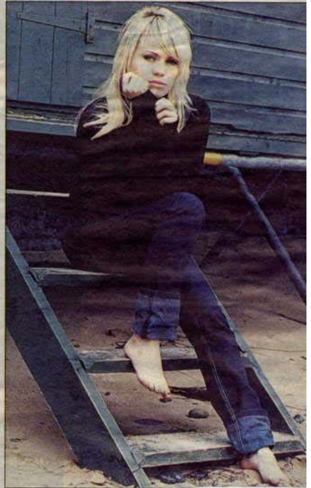
something special here as Duffy's tireless, boiler-suited percussionist joins in on double drums and her voice lets rip, liberated by sheer relief. She will go far, as long as we don't rush her.

The next single, Mercy, shows that the Motown formula: big beat, good vibes, soulful vocals, still makes people smile after 45 years. The encore is Distant Dreamer, limited on record but