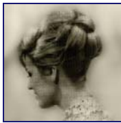
United Kingdom 5404 Posts