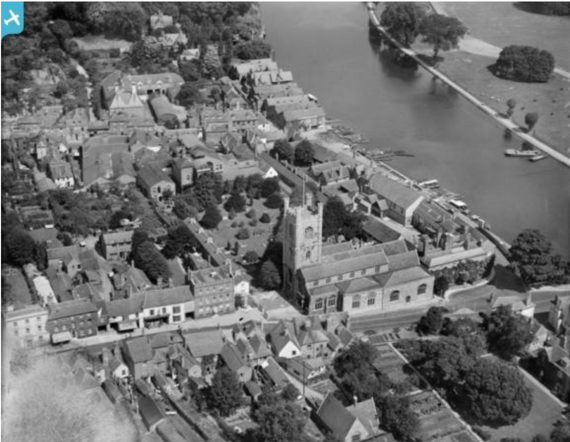
st mary's church.bmp (761.3 KiB) Viewed 811 times