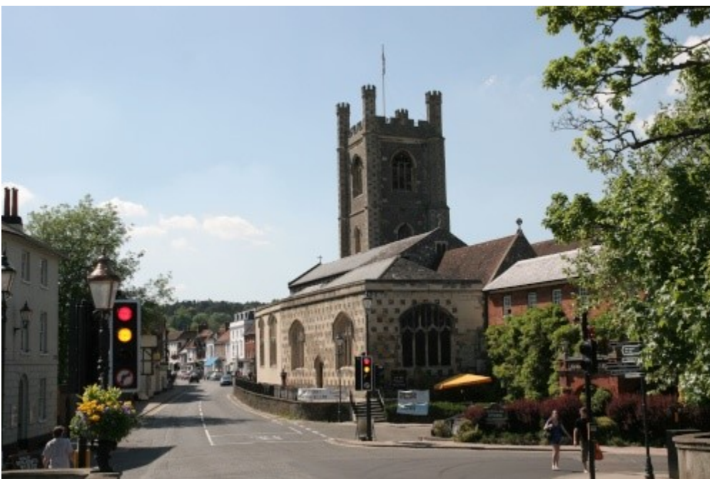
st mary's 2.bmp (487.85 KiB) Viewed 811 times

Dusty's gravestone is the town side of the building (i.e as far away from the river)