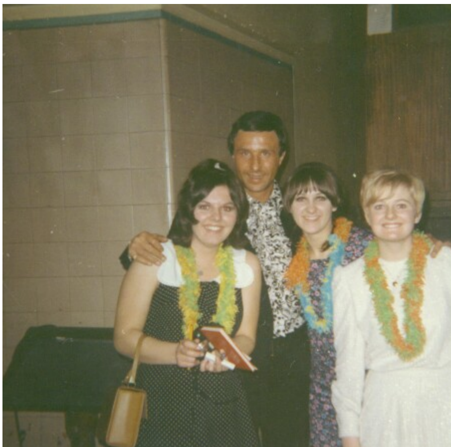
Scan-110221-0006.jpg (43.06 KiB) Viewed 4704 times