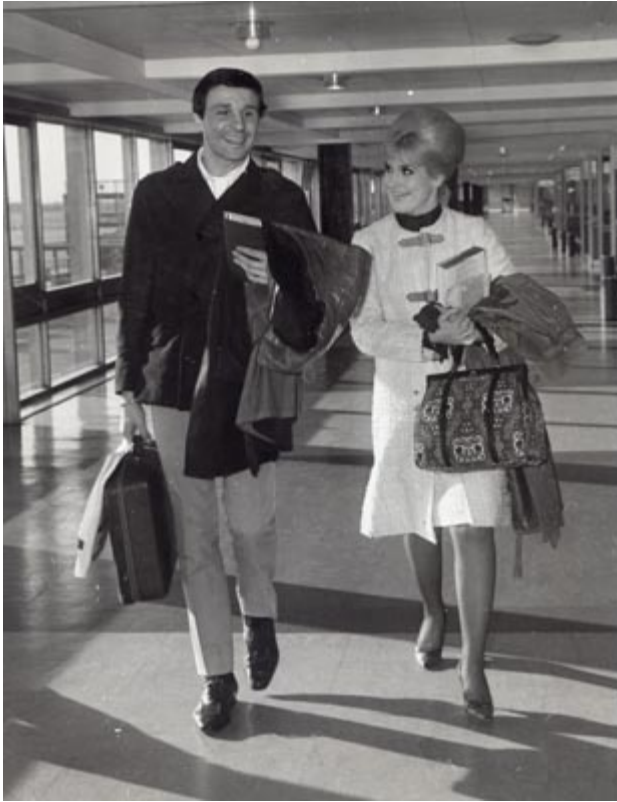
Peppi Dusty airport.jpg (42.18 KiB) Viewed 5638 times