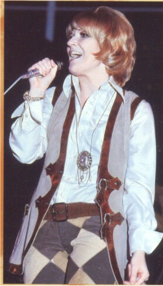
suede suit.jpg (48.17 KiB) Viewed 2318 times