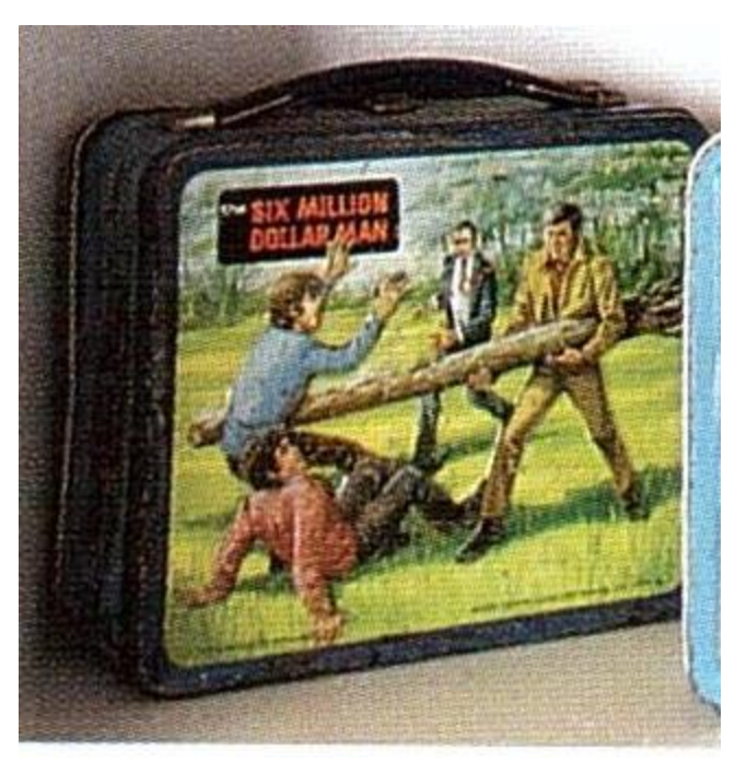
six.jpg (37.49 KiB) Viewed 907 times