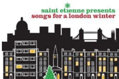
SAINT ETIENNE songs for winter.jpg (14.32 KiB) Viewed 3811 times