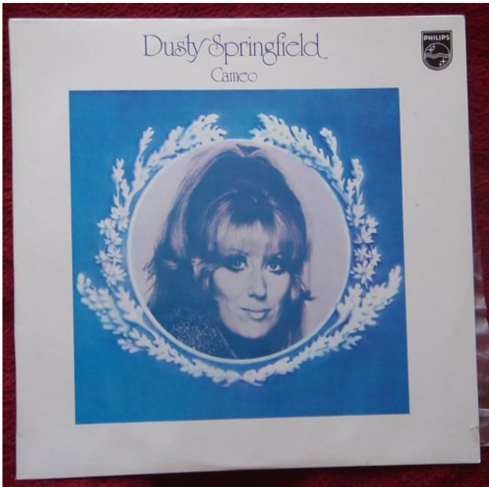
1973 - Cameo Australian.jpg (33.4 KiB) Viewed 1311 times