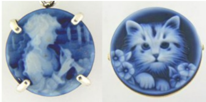
an oboe player and a kitty carved out of blue agate