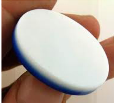
layered agate blueagate.jpg (30.97 KiB) Viewed 1274 times