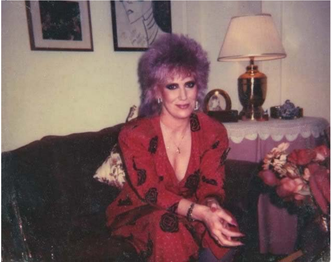
Here's the original.