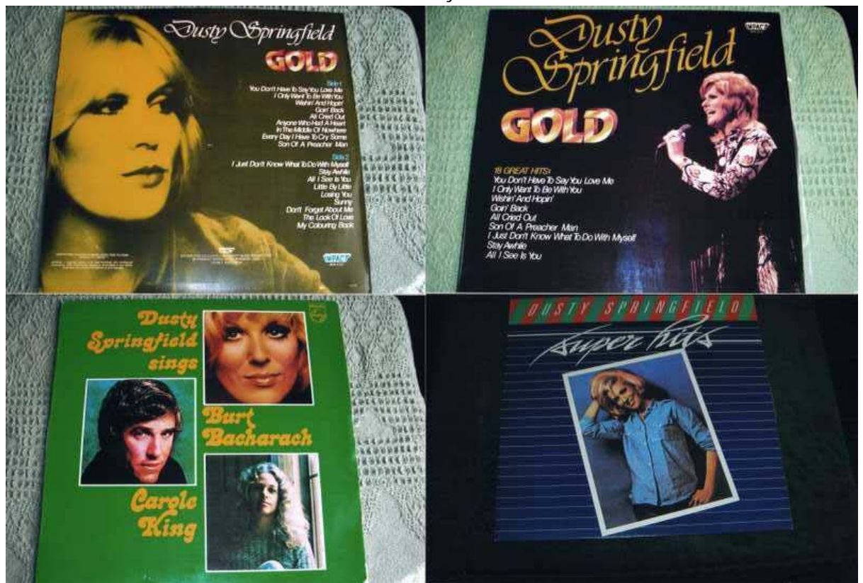
Australia (back) / Australia (front) / New Zealand / New Zealand