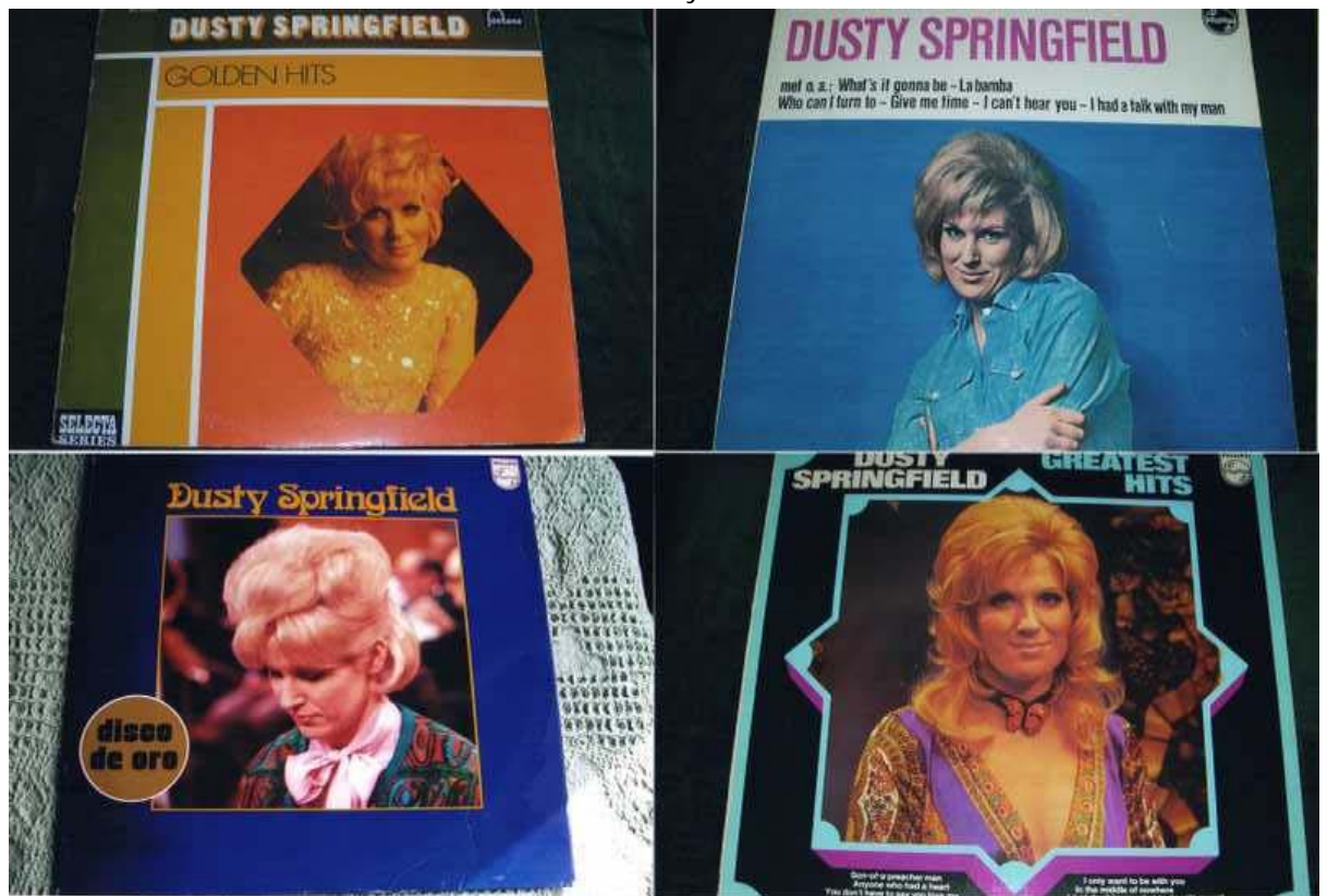
Holland / Holland / Holland / Spain