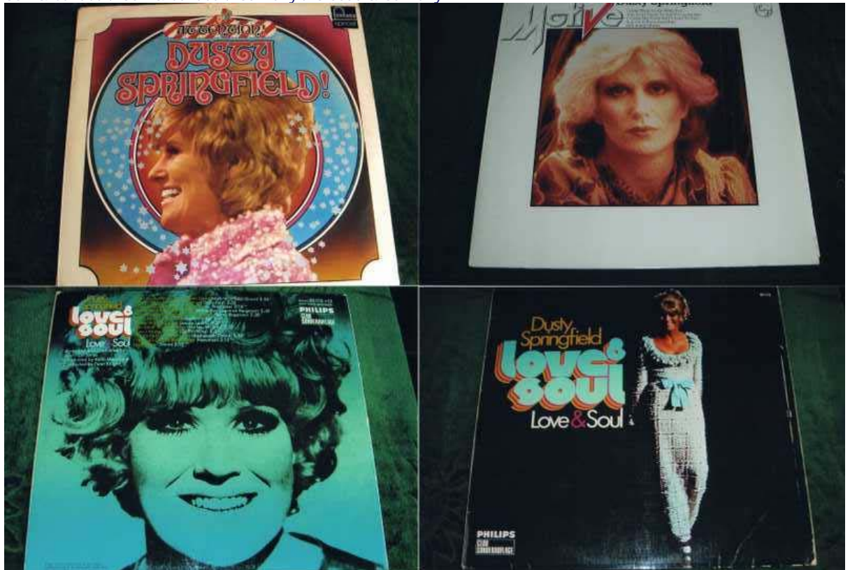
Germany / Germany / Germany (front) / Germany (back)