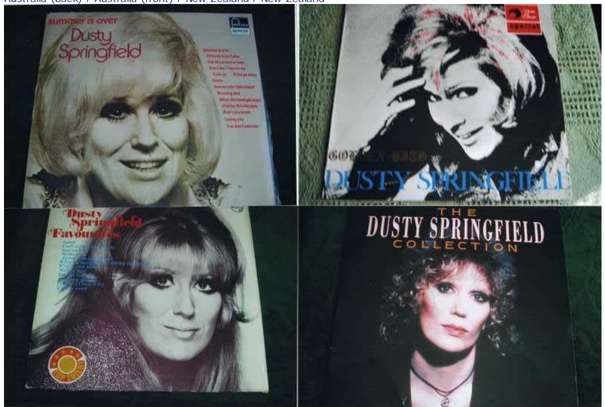
Holland / New Zealand / Holland / Holland