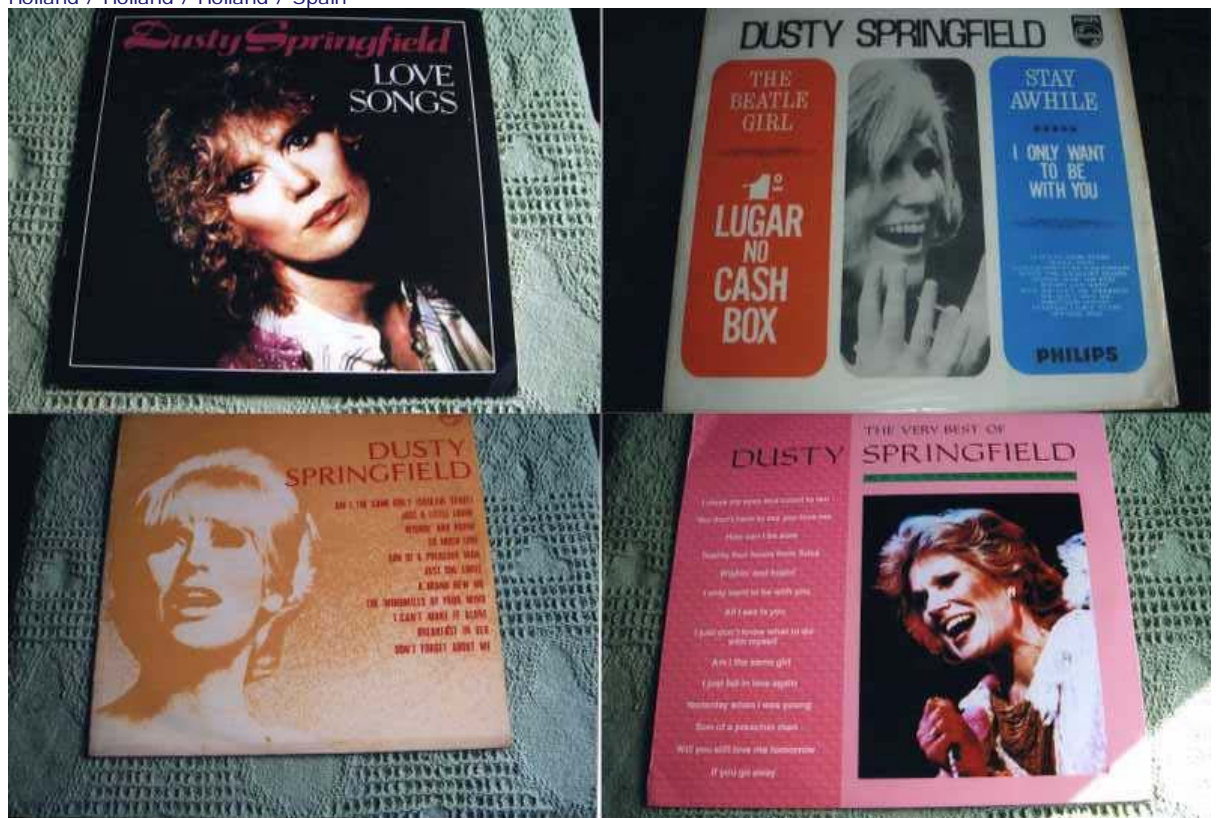
S. Africa / Brazil / S. Africa / Mexico