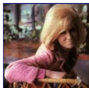
United Kingdom 1075 Posts