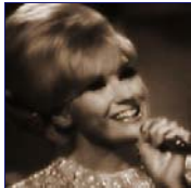
United Kingdom 1100 Posts