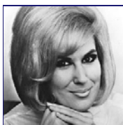
United Kingdom 428 Posts