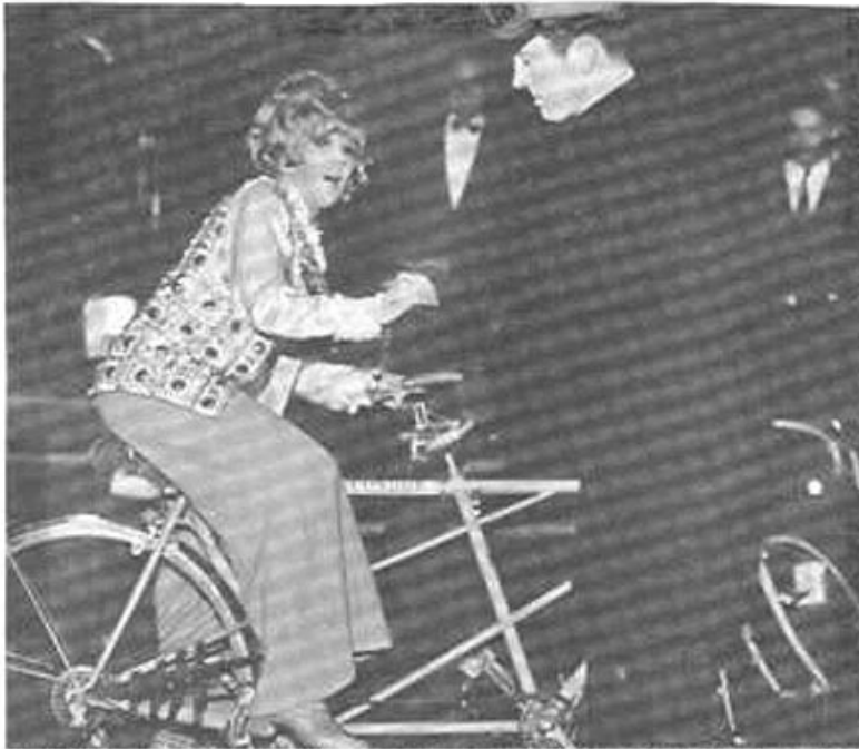
HARDLY the sort of pose you expect the lady Springfield to adopt . . . but that's how bystanders saw Dusty arrive at London's Grosvenor House Hotel in Park Lane last Wednesday when she provided colour at a swish charity event, the Alexandra Ross Ball. Miss Springfield, it seems, disagreed at the rising cost of living, increase in road taxes and spiralling petrol prices, and also possibly aware of the exorbitant price she has just paid for