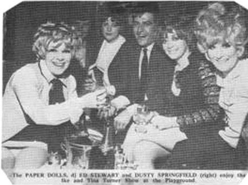
The PAPER DOLLS, d) ED STEWART and DUSTY SPRINGFIELD (right) enjoy the Ike and Tina Turner Show at the Playground.