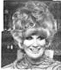
DUSTY SPRINGFIELD The husky-voiced singer whose appearances span the international circuit. Real name, Mary O'Brien. Educated at convents in Bucks and London, and once worked as a laundry assistant and record salesgirl, joined The Springfield in 1960, and went solo in 1963.

Although it's some time since she had a single in the NME Chart, there are few level-headed pop fans who would deny that DUSTY SPRINGFIELD —voted the World's Top Female Singer—will once again knock 'em cold at Wembley on Sunday! At the time of going to press, Dusty hadn't made up her mind about the members she will present (who can blame her, when her repertoire of hits is such a large one), and it was a particularly difficult choice—considering how busy she is right now. She told NME: "I've got so many commitments going on at the moment, I keep worrying in case I get them mixed up! I'm booked in my ANY (E) MUST BE DUSTY series, a concert for the Queen and the Duke of Edinburgh, a concert before Princess Margaret, and the NME show—all within the next week!"